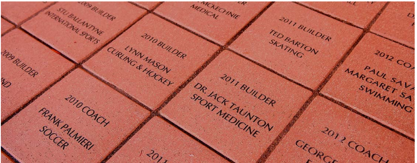
8" x 8" engraved donor recognition bricks